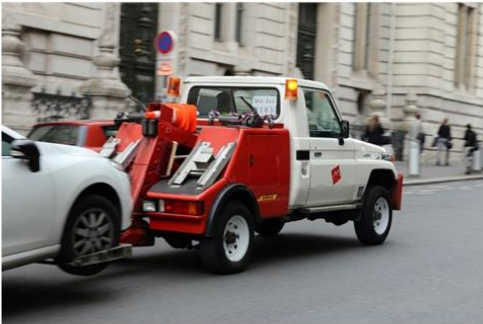
About 76,000 U.S. vehicles are impounded every day, 22% of which will rack up at least 15 days' worth of lot storage fees, according to a new report from Spireon.

IRVINE, Calif. — Vehicle intelligence provider Spireon has published “Impound Storage Fees, a Billion-Dollar Problem,” billed as the first report of its kind to address the costs to consumers, dealers, and lenders associated with vehicle impounds. With nearly 4 million vehicles connected to its NSpire IoT platform and nationwide database of impound lots, Spireon is uniquely capable of gathering impound-related insights on a massive scale for the automotive industry.