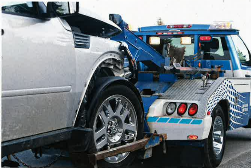
Telematics systems can be programmed to alert the fleet manager if a truck may have been stolen or towed.

The additional visibility of assets can help fleets ensure the work is being done. But it can also be used to mitigate risk and potentially avoid a lawsuit or a heavy fine.