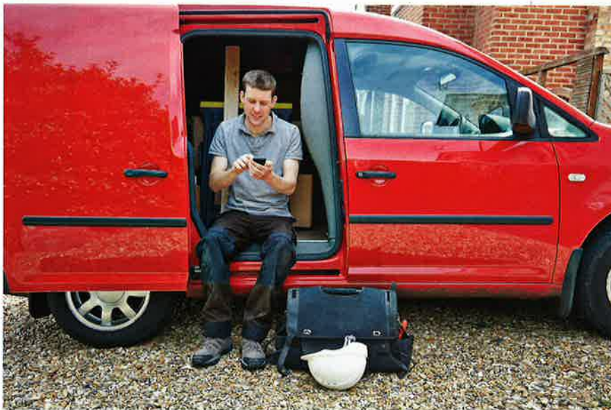
Telematics helps companies keep track of their assets, so the driver does not have to check in with regular status updates.

“Using GPS tracking, Texas Turf Management was able to see that some of their drivers were unnecessarily taking tollway roads to jobsites,”